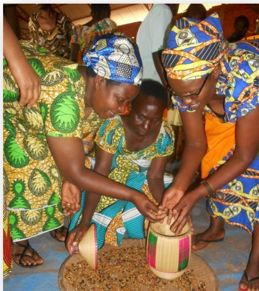
Above Women of Shangi, Rwanda by Dr. Nancy Peddle

Space is limited. In order to engage in the highest quality experience and have unique access to local sites a non-refundable $150 application fee and a non-refundable deposit of $1500 (for gorillas) is required per person to LemonAid Fund along with an interview to make sure this trip is a good match for you. Reservations are on a first come first serve basis. Reservation is based on double occupancy (single occupancy is $150 per day extra and roommate match is free).