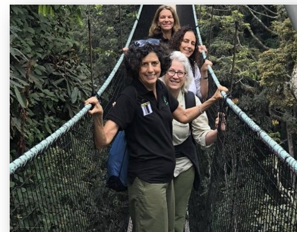
Canopy Walkway in the Nyungwe Forest

➤ ➤ Rwanda: 10 Nights January 18-28th, 2024